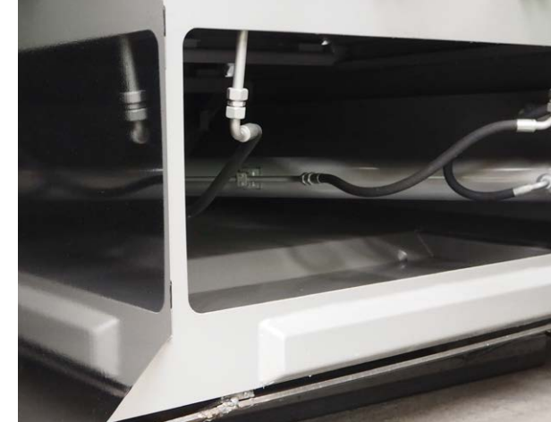
Self-cleaning tray in the press head