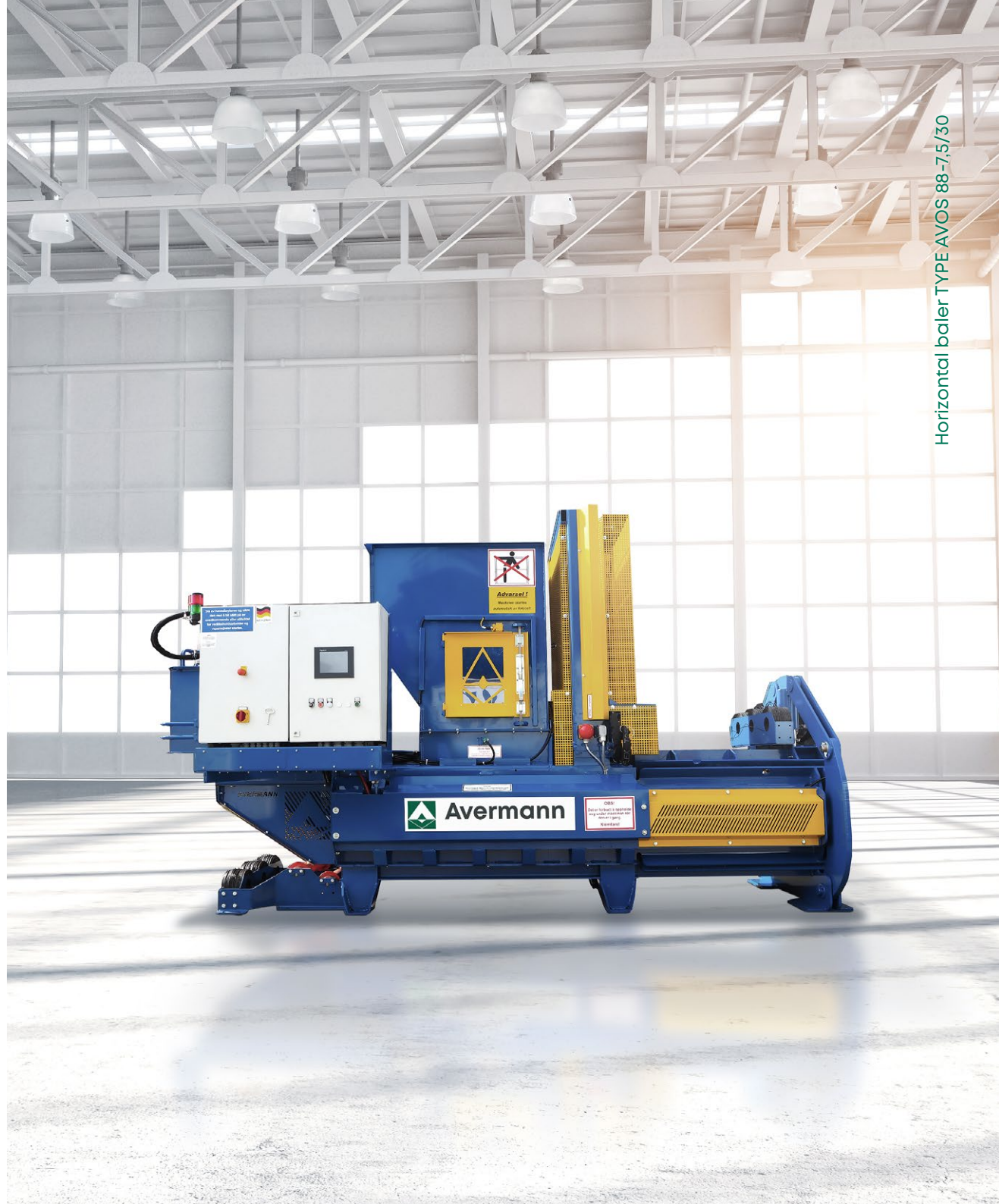
Horizontal baler TYPE AVOS 88-7,5/30

Phone +49 5405 505 - 0 . Telefax +49 5405 6441 info@avermann.de . www.avermann.de