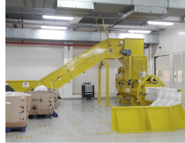
Version with sliding belt conveyor