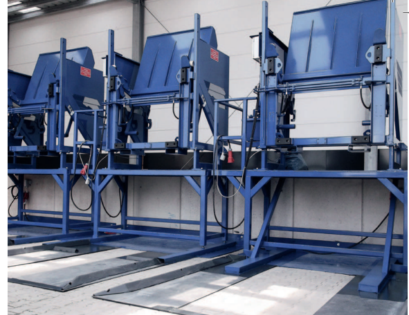
Mechanical lifting comb for 120/2401 containers