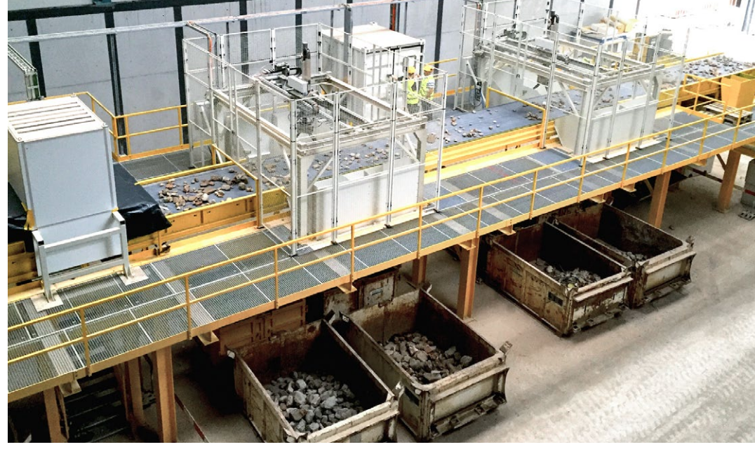
Sorting belt for fully automated robot sorting