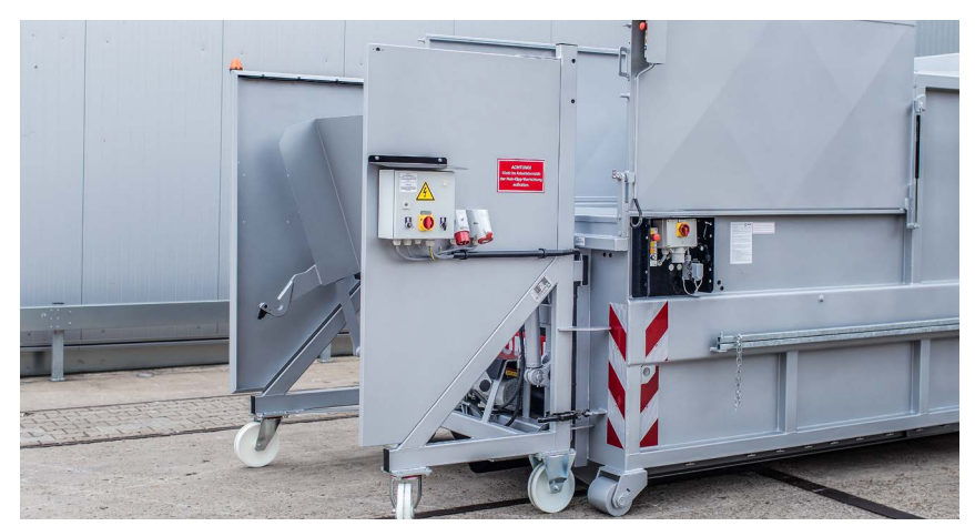
Integrated rear hook