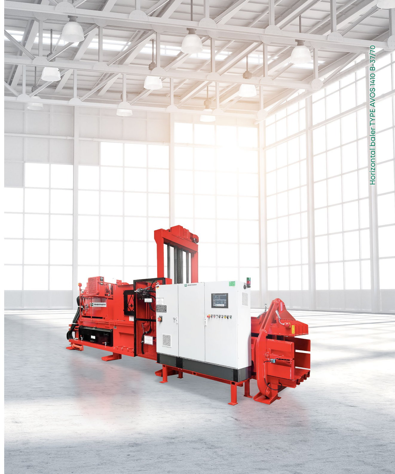
Horizontal baler TYPE AVOS 1410 B-37/70

Phone +49 5405 505-0 . Telefax +49 5405 6441 info@avermann.de . www.avermann.de