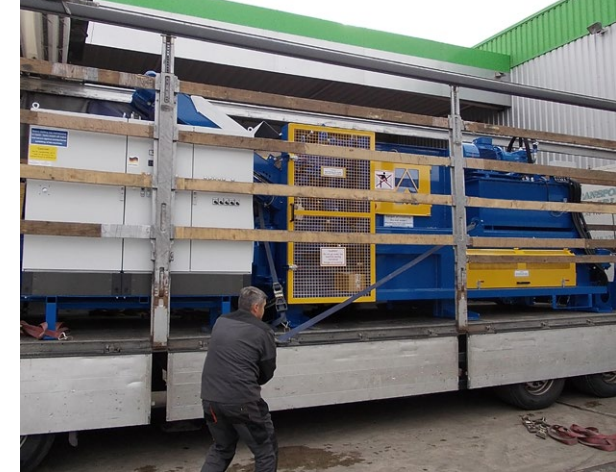
Delivery of an AVOS 1410 B baler