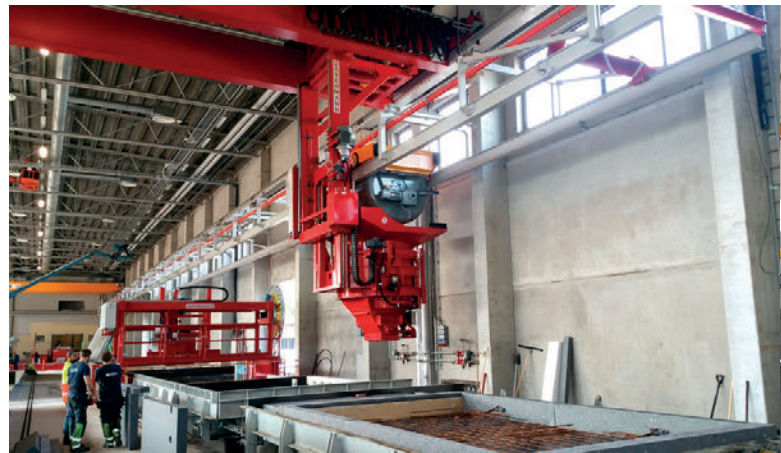
Detachable concrete spreader

As a genuine family business in the German SME sector, Avermann acts as a flexible and reliable partner with short re-