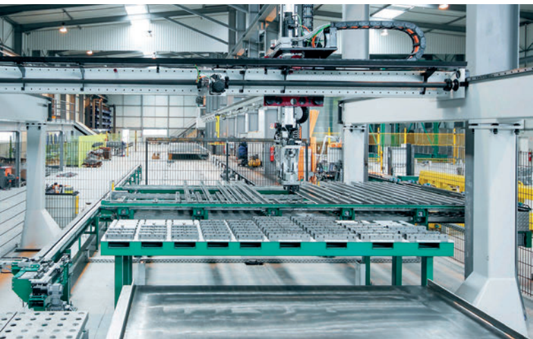
Formwork robot and formwork storage unit

ments in-house in Erfurt. This also guarantees a constant level of production quality to meet the company's high standards. This combination of customer proximity, flexibility, and innovative strength has led to many long-standing partnerships, for which the Avermann Group would like to express its sincere thanks on behalf of the proprietary family and the entire workforce. It is these national and international partnerships grown up over the years that have laid the foundation for success. As a reliable and competent partner, the Avermann concern is delighted to be able to continue these on a long-term basis, and looks forward to a future full of innovation!