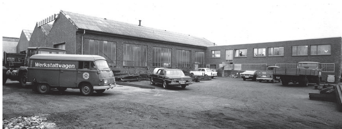
Central house with production halls in the 1970s