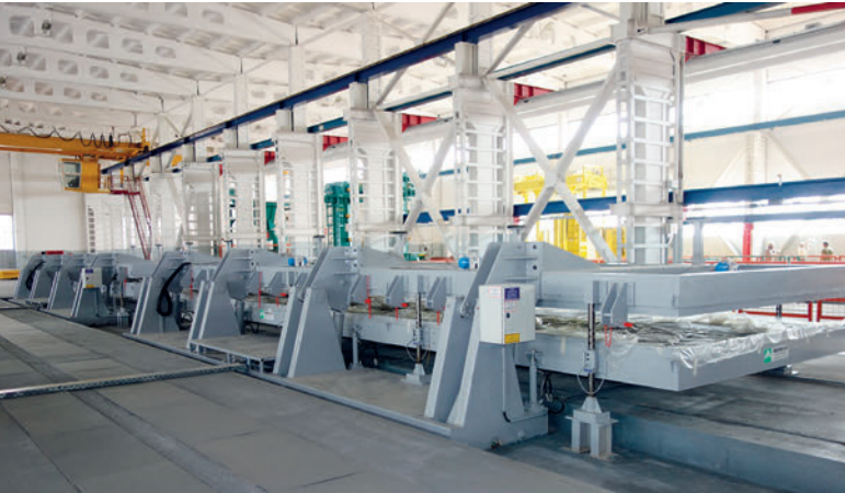
Tandem design turning pallet