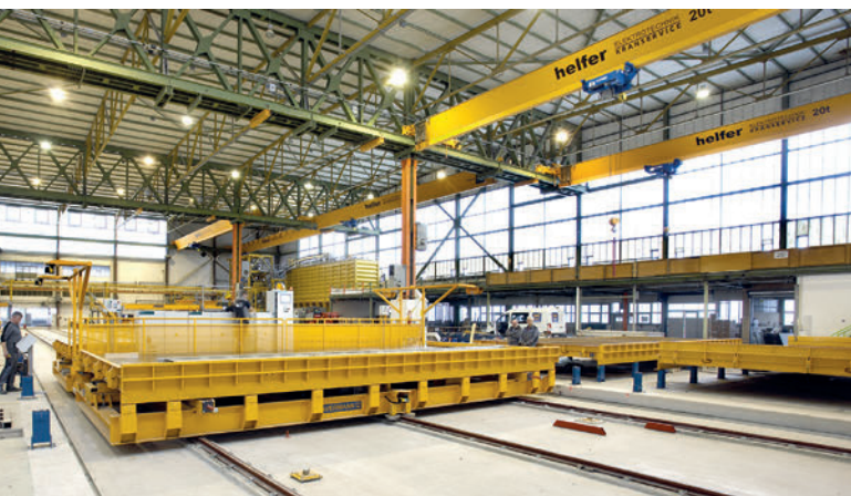
Central transfer table

This will be accomplished at Avermann through an extensive product range in three different sectors: precast concrete technology, environmental technology, and laser and bending technology. The product range extends from machines, such as tilting tables, concrete spreaders, girder formwork, power trowels, storage and retrieval systems, conveyor belts, baling presses and mobile compactors right up to fully-fledged, large-scale facilities and abstract special solutions in both the precast concrete and environmental technology sectors. It is also advantageous that supply chains can be kept appropriately short by manufacturing lasered and bent ele-