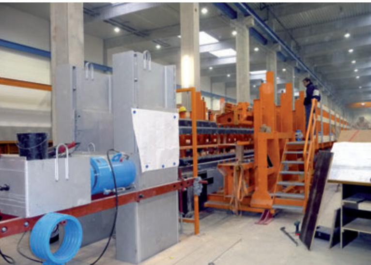
Prestressing technology by the Paul company (relaxation side)