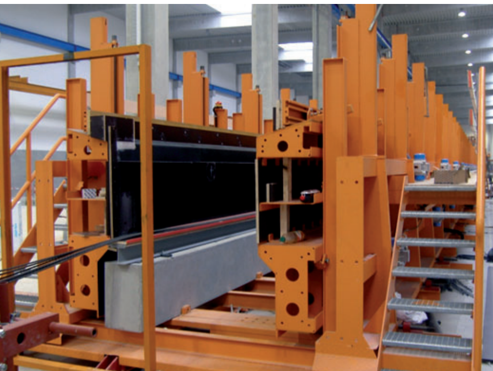
Formwork with hook-in parts for beams

Due to the extreme formwork length of 99 m, 4-5 identical elements can usually be manufactured in parallel in the universal formwork, depending on the dimensions of the concrete parts. This allows even large quantities to be supplied within the shortest time.