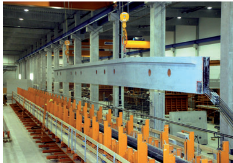
Lifting out a gable roof beam

Several 40-tonne double-girder bridge cranes are installed in order to enable the setting up of the formwork as well as the subsequent lifting out of the finished parts.