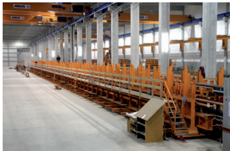
Overall view of the 99 m long universal formwork