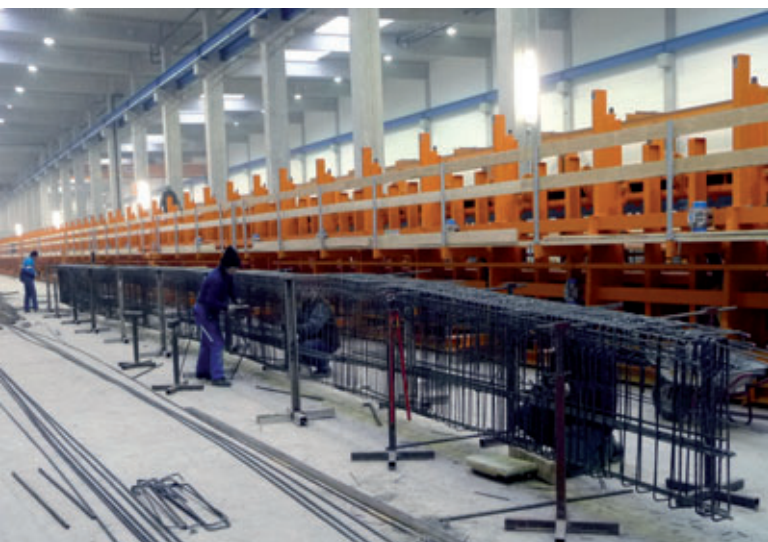
Manufacture of the reinforcement cage

Ostensibly designed for the manufacture of single and double beams up to a maximum height of 2,400 mm, parallel beams or gable roof beams can alternatively be manufactured. The bottom and top chord geometries are implemented in steel; the ribs are adjusted to the respective size by means of Betoplan boards. This also enables the infinite setting of any angle of inclination for the gable roof beams.