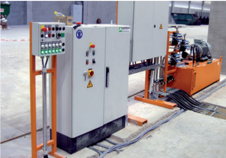
Operating station with hydraulic and vibrator control