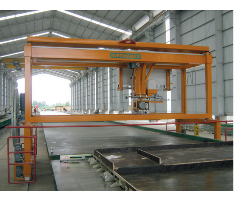
The tilting table system includes this power trowel, which gives the necessary high quality to the rear sides of these flat precast concrete elements