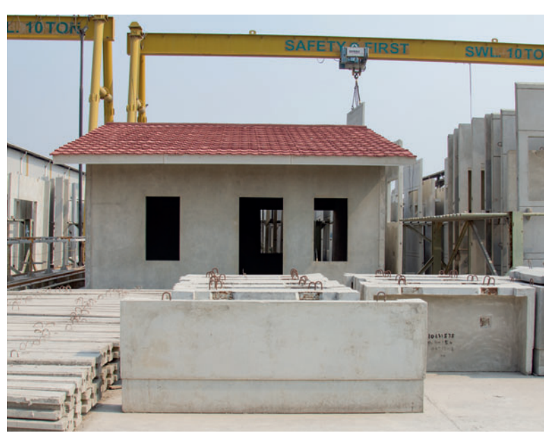
PT Motive Mulia also produces low-cost houses, which the company offers in differing versions.

Stripping the formwork from the wall panels takes place in a similar way on the next day. The machine travels under the production line and is placed in position. The hydraulic device