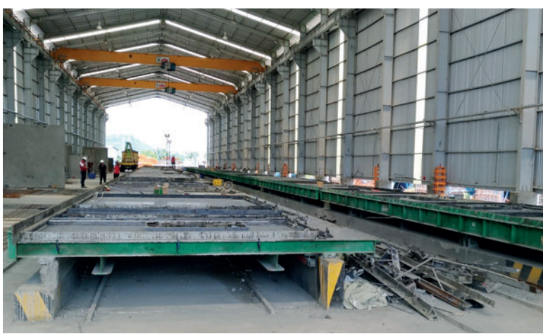
16 tilting tables are set up on two lines running parallel to each other in the production hall.