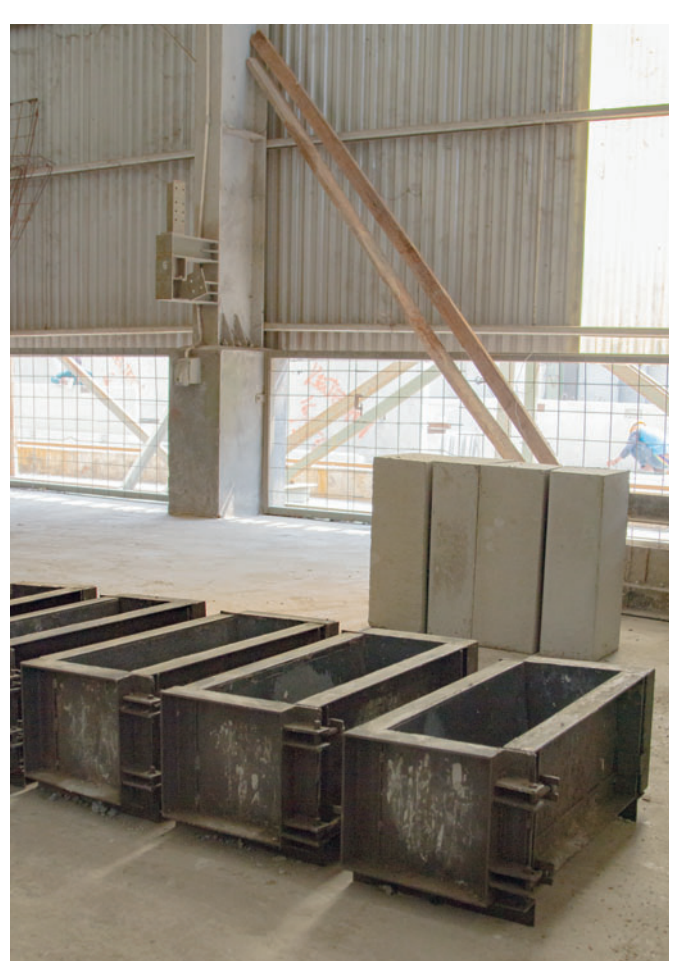
Residual concrete is utilised by PT Motive Mulia for a by-product - kerbstones (at the rear) - that separate pavements from the road carriageway in the capital, Jakarta. The company makes its own steel moulds (in the foreground) for this purpose.