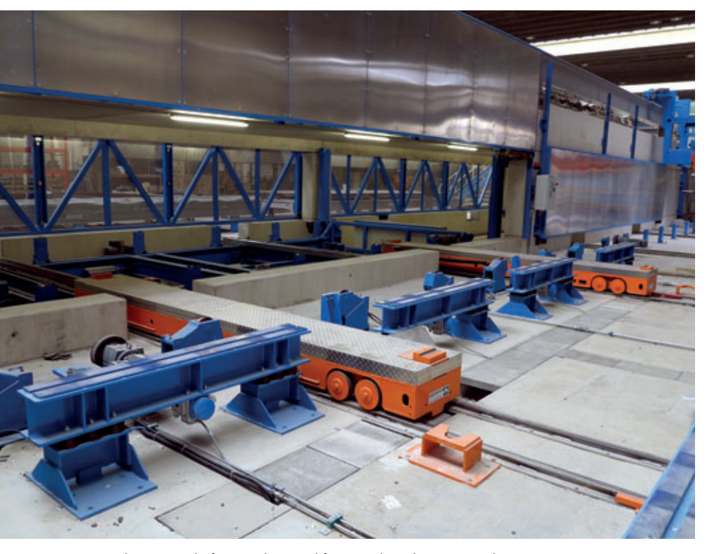
Central moving platform with cross-lifting truck at the entry to the compaction station

For the new plant the existing Hall 3 had to be cleared out and appropriate alterations had to be made with pits and the like, in particular for the operation of the moving platform. An additional new hall was erected for the hardening and removal area.