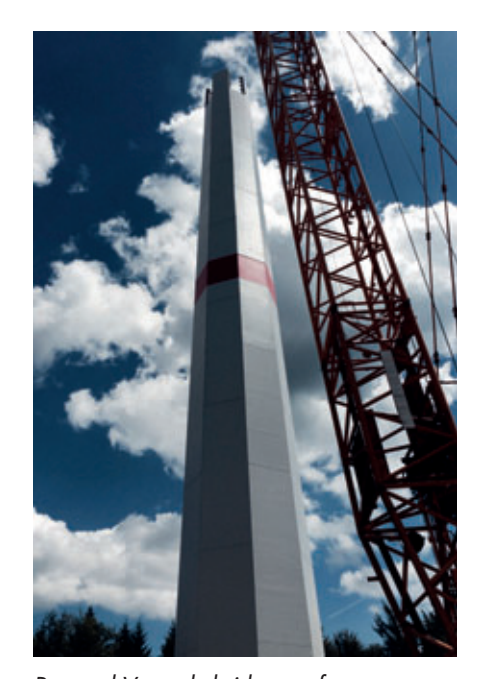
Patented Ventur hybrid tower for wind turbines

After many years of manufacturing precast concrete elements on tilting tables and stationary production lines, Benno Drössler GmbH & Co. Bauunternehmung KG of Siegen decided to optimise the proven production by the use of a pallet circulation plant. The concept was specified with all detail requirements in autumn 2013, after which tenders were invited and quotations obtained from various plant manufacturers. The Avermann company was awarded the contract for the delivery of the pallet circulation plant in a package together with its subcontractor SAA Engineering, which supplied the process and circulation controller with control system.