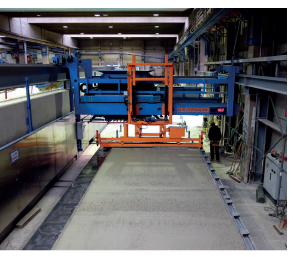
Concrete distributor in bridge design with levelling device

concrete distributor - lowerable internal spud vibrators are installed here amongst other things - and the HF compaction station installed at one station, all specified concretes can be discharged and compacted.