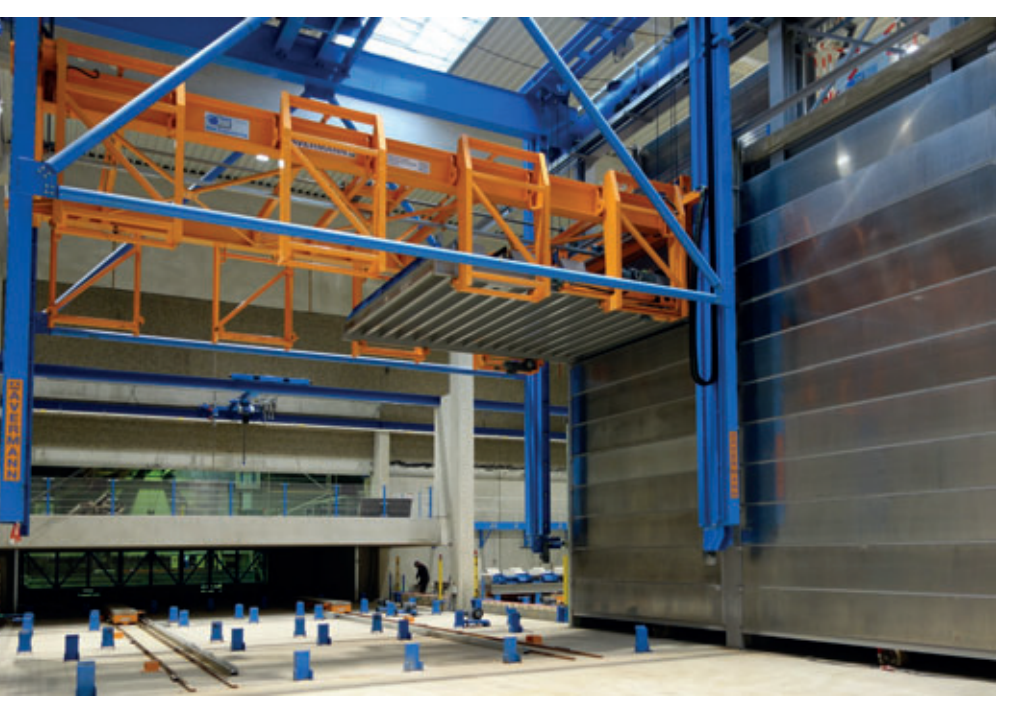
Storage and retrieval machine for hardening chamber feeding

The concept was specified with all detail requirements in autumn 2013, after which tenders were invited and quotations obtained from various plant manufacturers. As a result of the sounding-out/negotiations, the Avermann company was awarded the contract for the delivery of the pallet circulation plant in a package together with its subcontractor SAA Engineering, which supplied the process and circulation controller with control system.