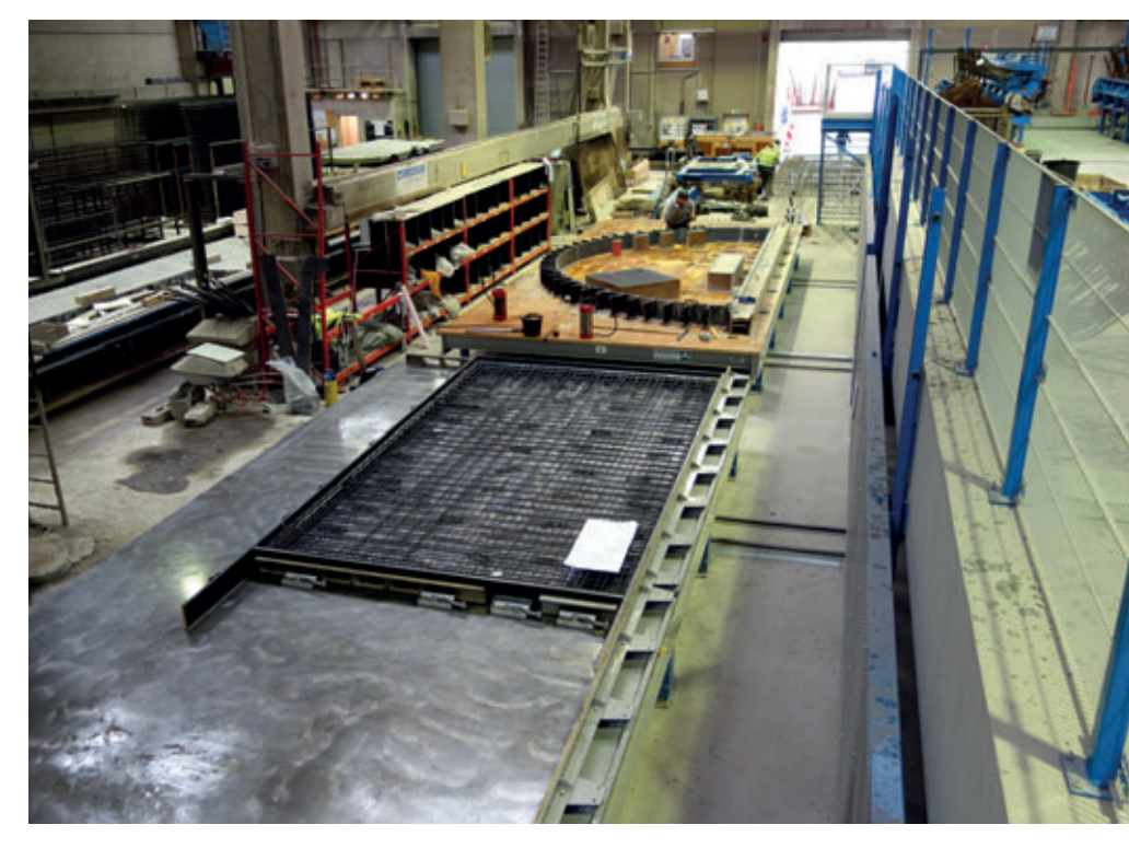
Fig. 5: Shuttering and reinforcing stations for solid/sandwich walls and custom elements

Normal concrete is also processed in addition to self-compacting concrete (SCC). A concrete distributor with a bridge design is available for this; it is fed by a bucket track and serves two workstations. Including various additional items of equipment on the